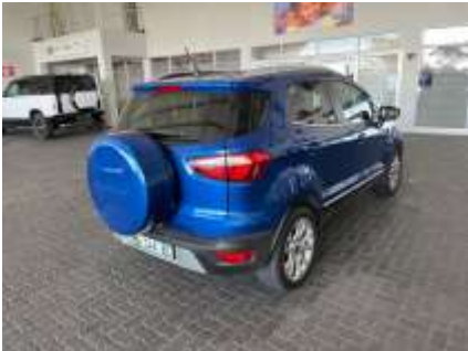
Vehicle Image FRONTIMAGE