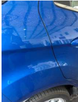
Right Rear Fender