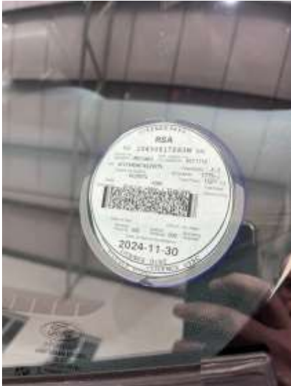
Vehicle Image LEFTIMAGE