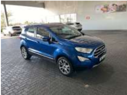
Vehicle Image MAINIMAGE